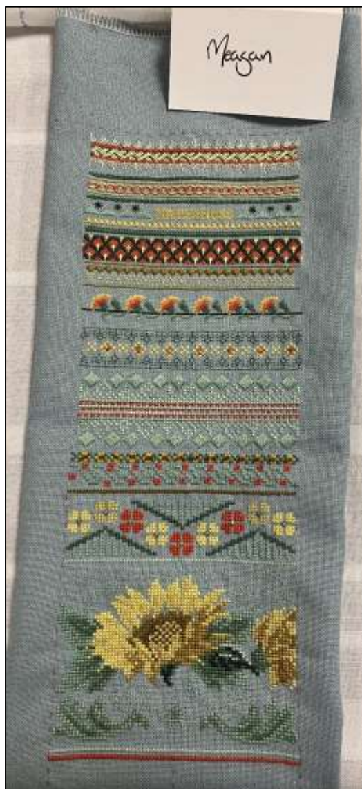
Sampler stitched by Meagan