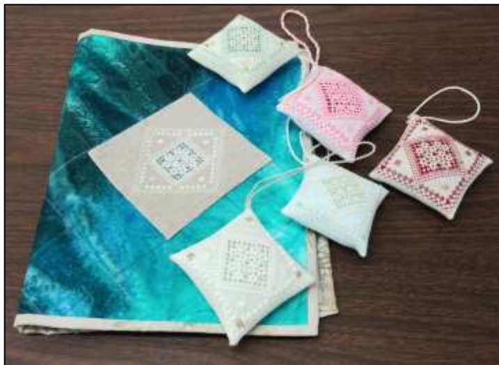
Sicilian Embroidery Workshop - Chiaramonte Technique

Following are some photos of recent works completed by our members. We send them along with our best wishes for a safe and relaxing summer.