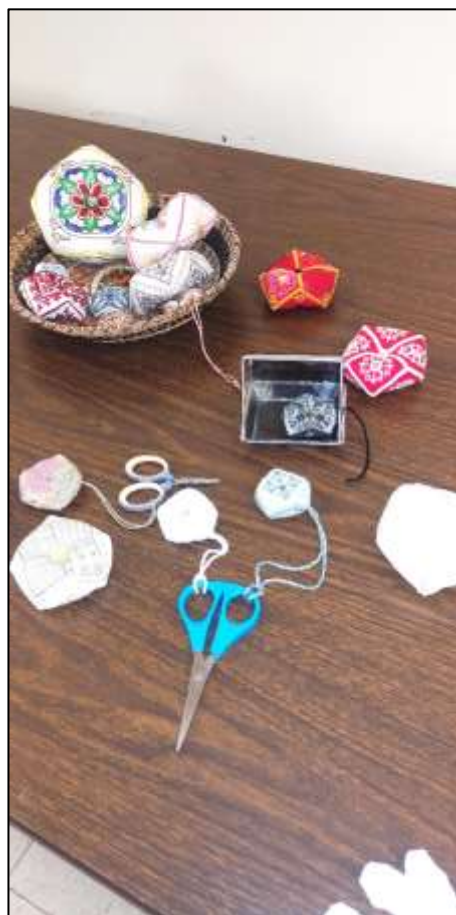
Biscornu Pin Cushion - Embroidery Canada Spring 2025